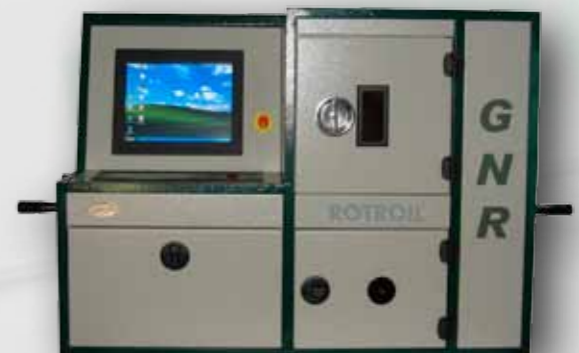
PC built-in included with touch screen management (option)